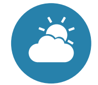
the best weather and nature