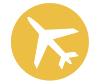
the best tourist city