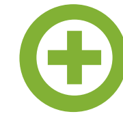
the best safe city