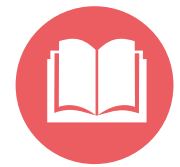
the largest language training area